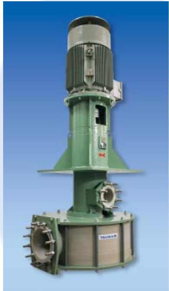
无机械密封 No Mechanical Seal

BT 潜液泵 增强型，悬臂式轴，潜液深度可达1.2米 Sump pump, reinforced. Cantilevered shaft. Depth up to 1,2m.