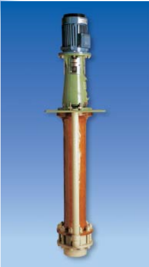
干运行能力 Dry Running Capability